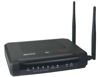
Wireless-N Nfiniti ADSL2+ Modem Router

The New AirStation Wireless-N ADSL2+ Modem Router with Buffalo's AirStation One-Touch Secure System™ (AOSS™) uses the latest high-speed Wireless LAN technology delivering 270Mbps Wireless throughput. The AirStation incorporates a built-in 4-Port Router with fast 100Mbps throughput and a built-in ADSL2+ modem.