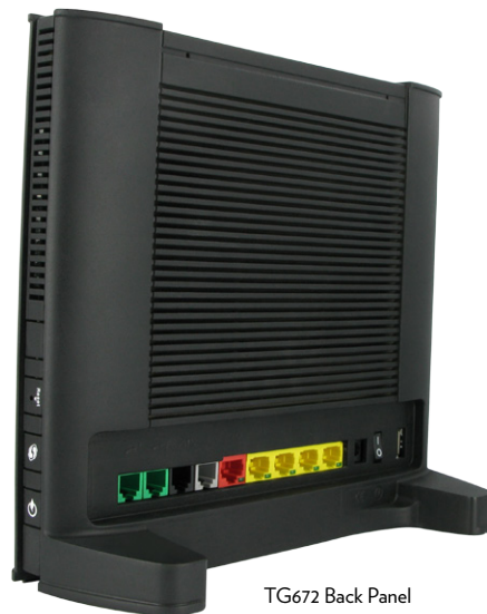
TG672 Back Panel

Technicolor Professional Services are available to address your demands for qualified technical support & warranty, product maintenance, access to training courses and tailor-made solutions to specific product evolution. For more information, please ask your usual contact person.